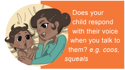
O NOT YET / A LITTLE 5 SOMETIMES 10 A LOT