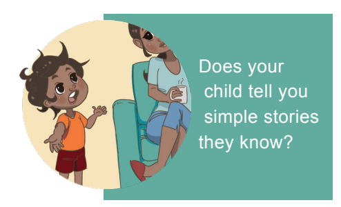
O NOT YET / A LITTLE 5 SOMETIMES 10 A LOT