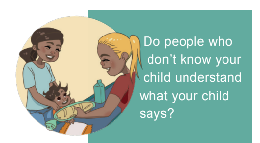
0 NOT YET / A LITTLE 5 SOMETIMES 10 A LOT