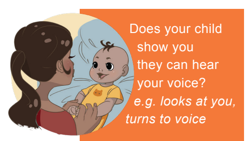
O NOT YET / A LITTLE 5 SOMETIMES 10 A LOT