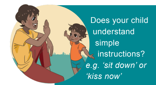
O NOT YET / A LITTLE 5 SOMETIMES 10 A LOT