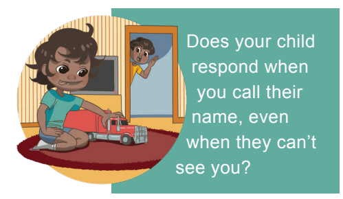
O NOT YET / A LITTLE 5 SOMETIMES 10 A LOT