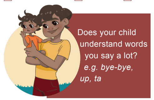
O NOT YET / A LITTLE 5 SOMETIMES 10 A LOT