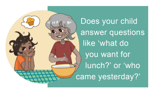
O NOT YET / A LITTLE 5 SOMETIMES 10 A LOT