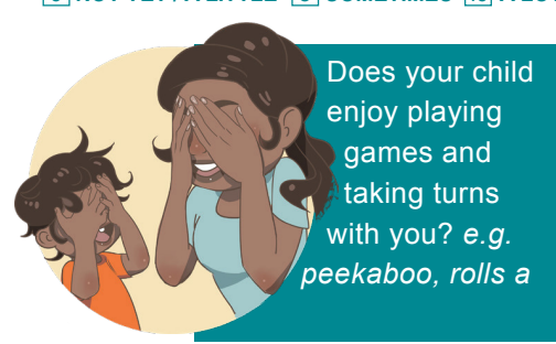
O NOT YET / A LITTLE 5 SOMETIMES 10 A LOT