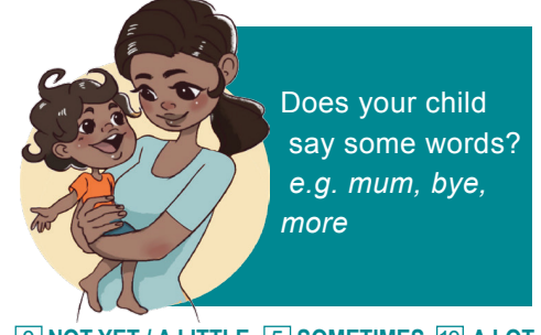
O NOT YET / A LITTLE 5 SOMETIMES 10 A LOT