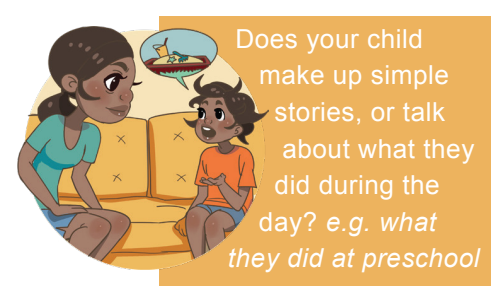
O NOT YET / A LITTLE 5 SOMETIMES 10 A LOT