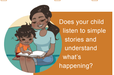
O NOT YET / A LITTLE 5 SOMETIMES 10 A LOT