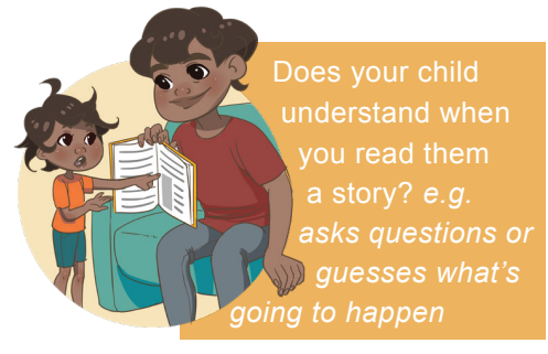
O NOT YET / A LITTLE 5 SOMETIMES 10 A LOT