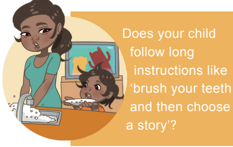
O NOT YET / A LITTLE 5 SOMETIMES 10 A LOT